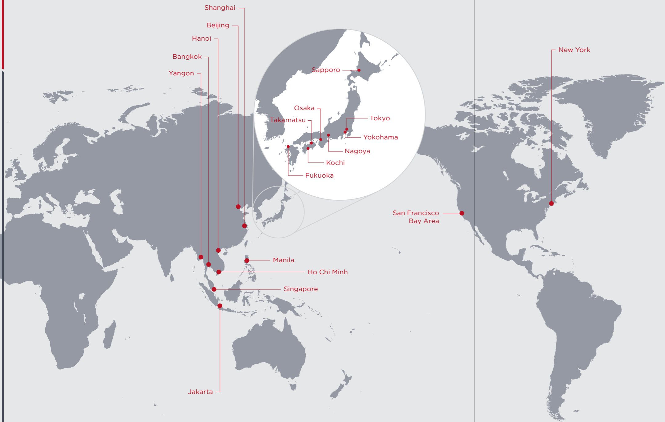
● Mori Hamada Offices (as of May 2025) (including branch offices of Mori Hamada & Matsumoto LPC and member firms)